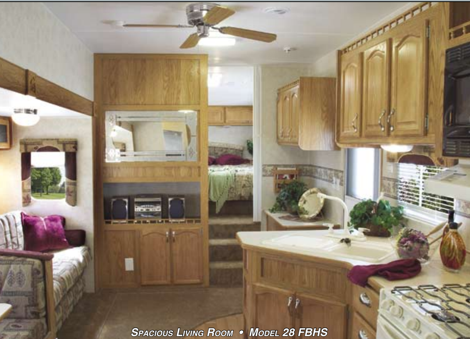
SPACIOUS LIVING ROOM • MODEL 28 FBHS

You will appreciate the Amish-crafted cabinetry... featuring generous base and overhead storage, and mirrored overhead doors, this interior exudes class. Designer-coordinated decors feature only the finest durable fabrics and carpeting, for an overall look of quality and craftsmanship.