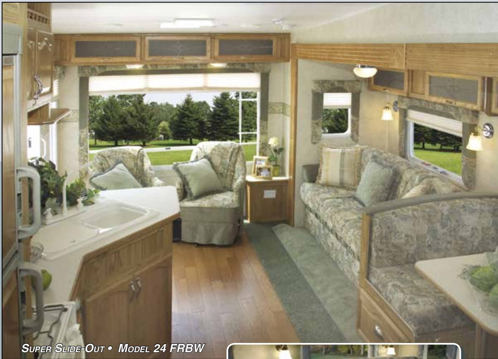
SUPER SLIDE-OUT • MODEL 24 FRBW

Shown in Leaf Green with supreme package