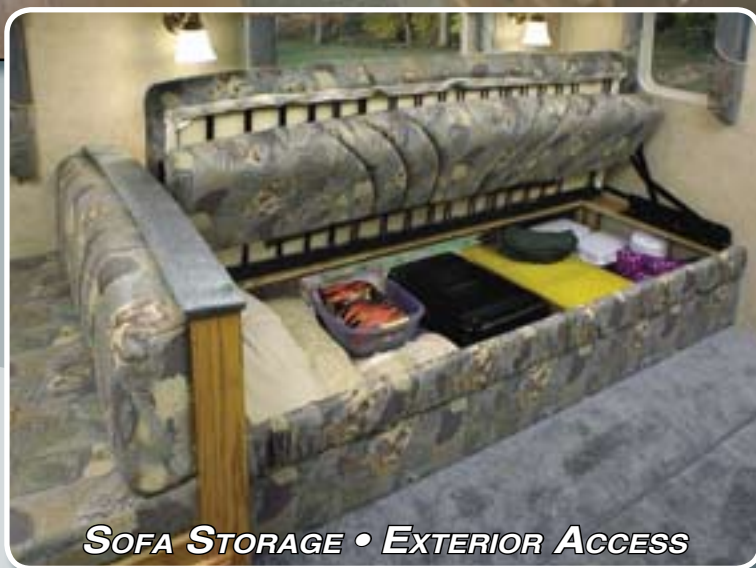
SOFA STORAGE • EXTERIOR ACCESS

Gulf Stream offers you more features as standard than any other manufacturer, and at a price that won't be beat!