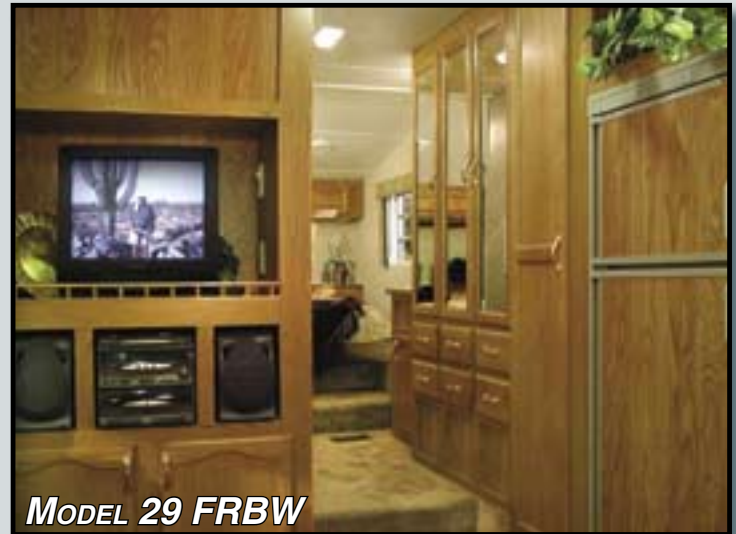
MODEL 29 FRBW

Available on 24 BHL, 275 FBD/FBS, 295 DBR/DBS, 30 BHS, 28 FBHS, 26 FBHS