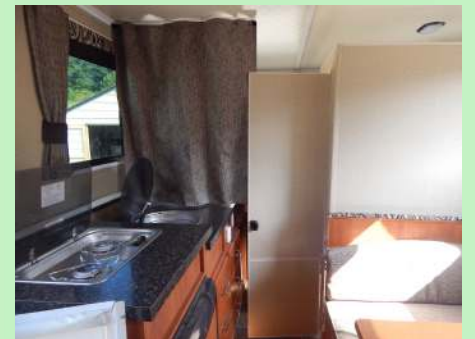
Curtain and door close off back of trailer to create private dressing area