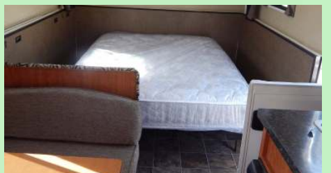
Murphy Bed Floorplan