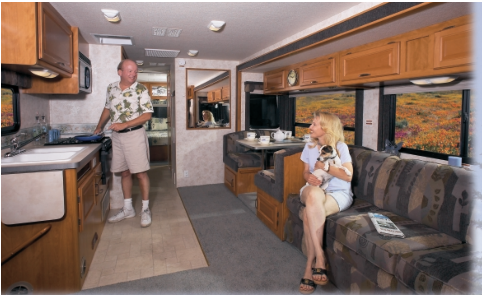
Shown in Blue Dusk