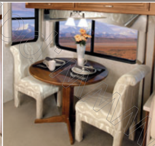
THE FREE STANDING DINETTE provides 2 additional folding chairs (not shown) to comfortably seat 4 and a large window for an excellent view of your surroundings.