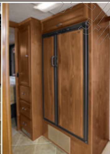
THE 12 CU. FT. SIDE BY SIDE NORCOLD® REFRIGERATOR has plenty of room for food and drink, and features an icemaker (See Features List for brands offered).