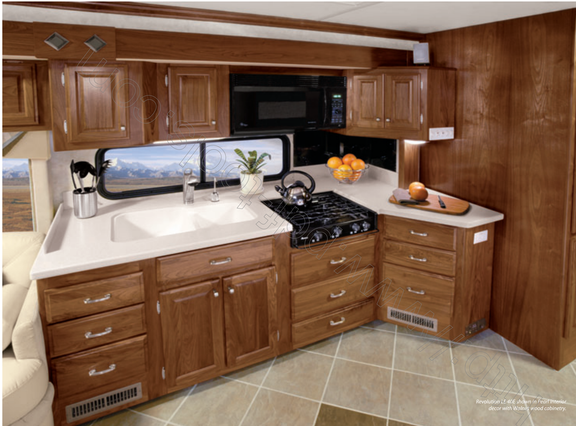
Revolution LE 40E shown in Pearl interior decor with Walnut wood cabinetry.