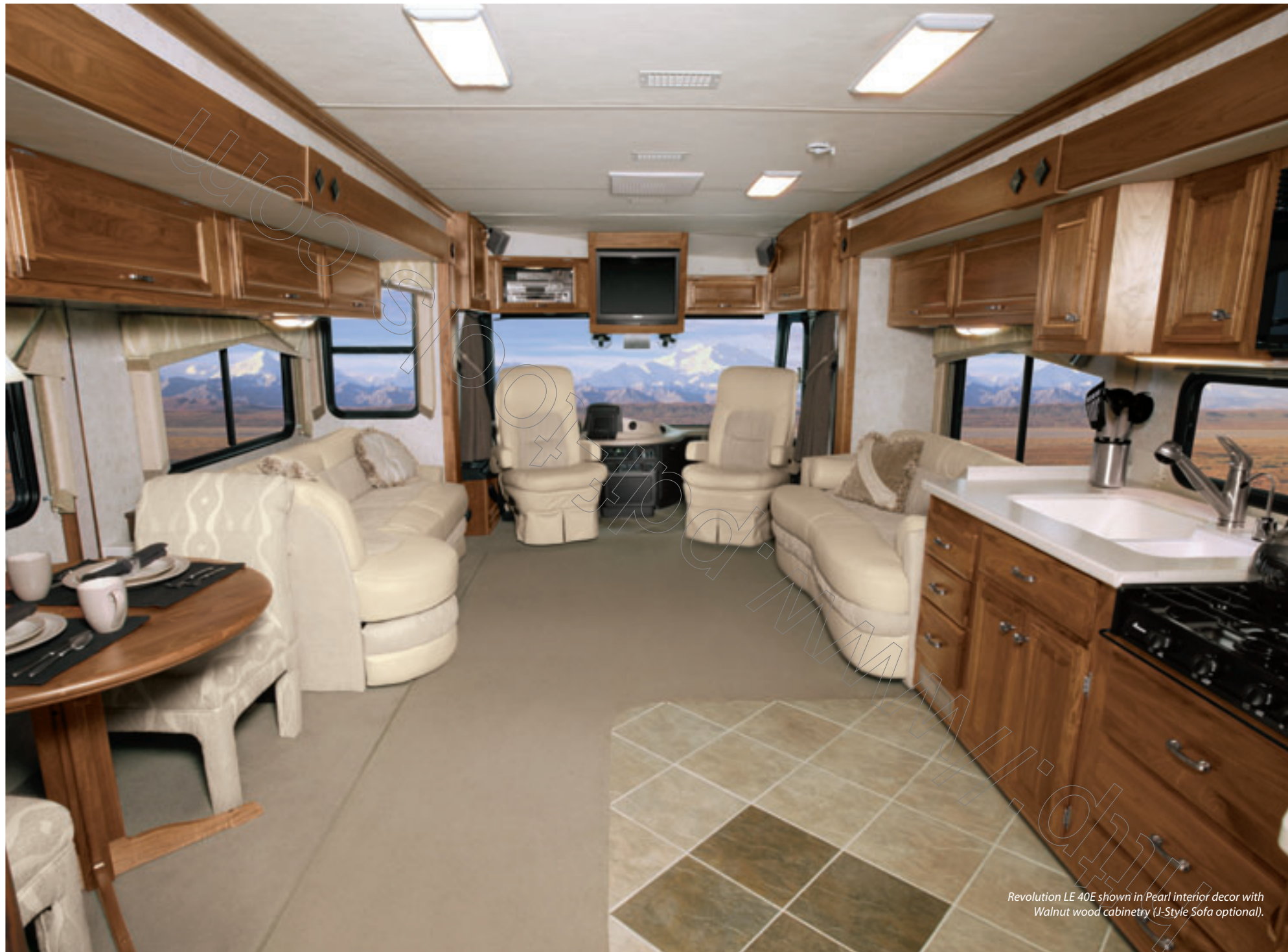
Revolution LE 40E shown in Pearl interior decor with Walnut wood cabinetry (J-Style Sofa optional).