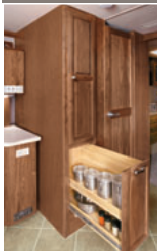
THE KITCHEN PANTRY includes convenient pull-out shelves for easy storage of non-perishable goods.

the road. Roam about freely with a tall 84" flat ceiling and enjoy luxurious Flexsteel® Ultraleather furniture. You'll also love the plush Fabrica® carpeting and diagonally laid tile flooring. Contemporary design meets a residential appeal, welcome to your new home.