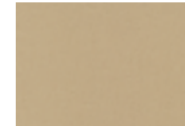
Ultraleather Sofa & Recliner