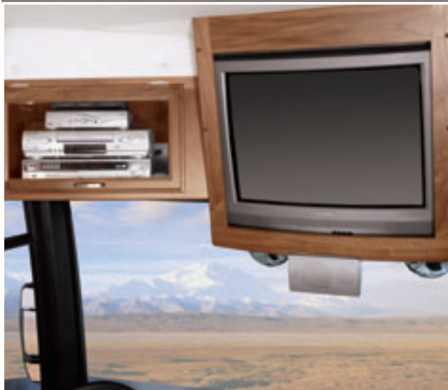
THE ENTERTAINMENT CENTER features a 27" Panasonic® TV, a 4 head Panasonic® VCR and a state of the art Panasonic® home theater system with DVD player, providing the ultimate entertainment environment.

driver/passenger seats and enjoy features like the Visteon® AM/FM radio with CD player. Revolution combines state of the art features with its superior construction, giving you a ride you won't soon forget.