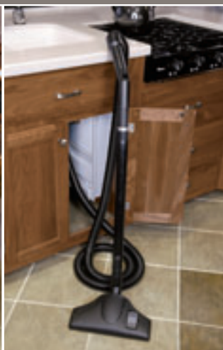
THE CENTRAL VACUUM (optional) is very handy for quick clean up, and easily stores away when not in use.