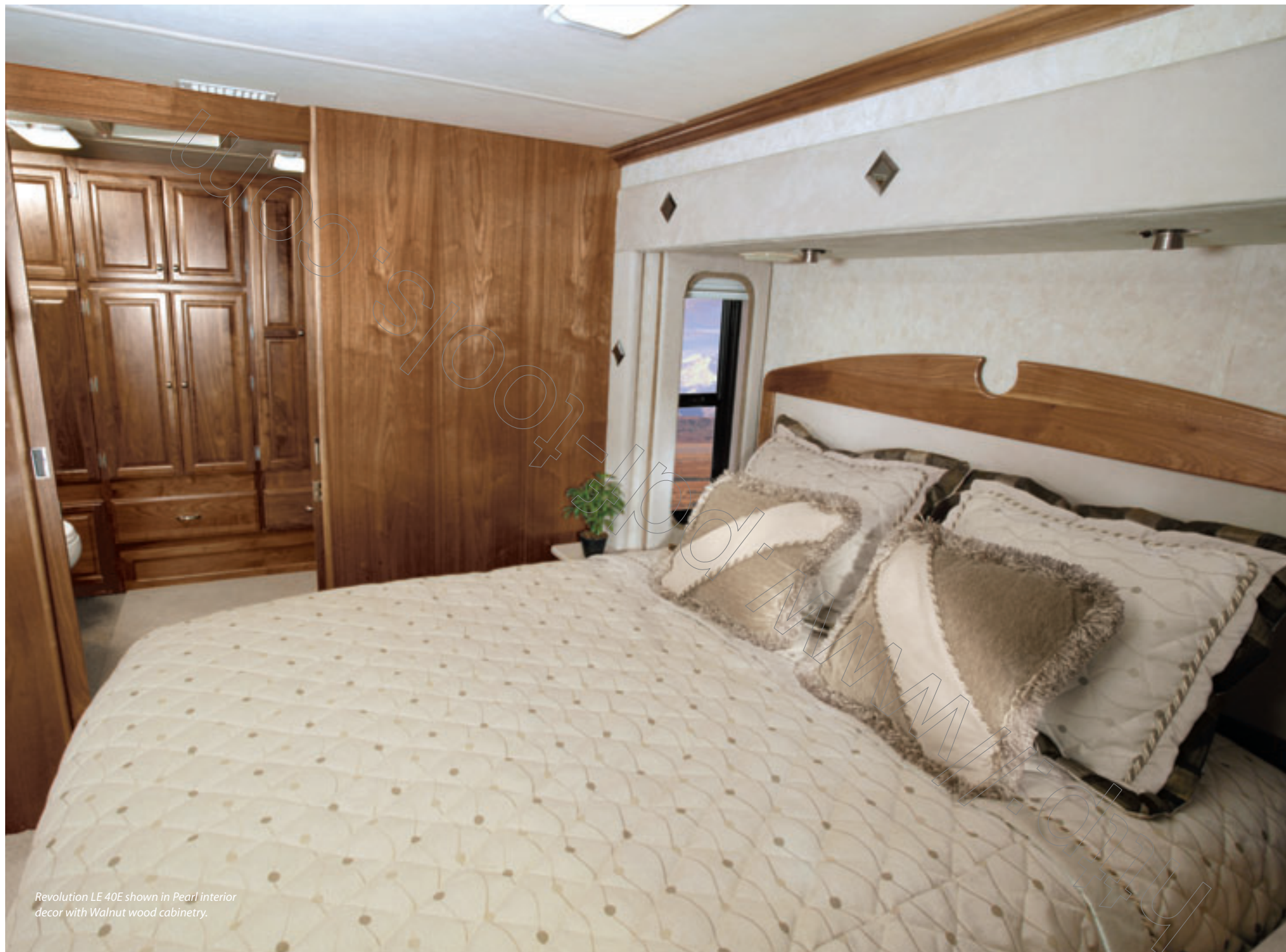
Revolution LE 40E shown in Pearl interior decor with Walnut wood cabinetry.