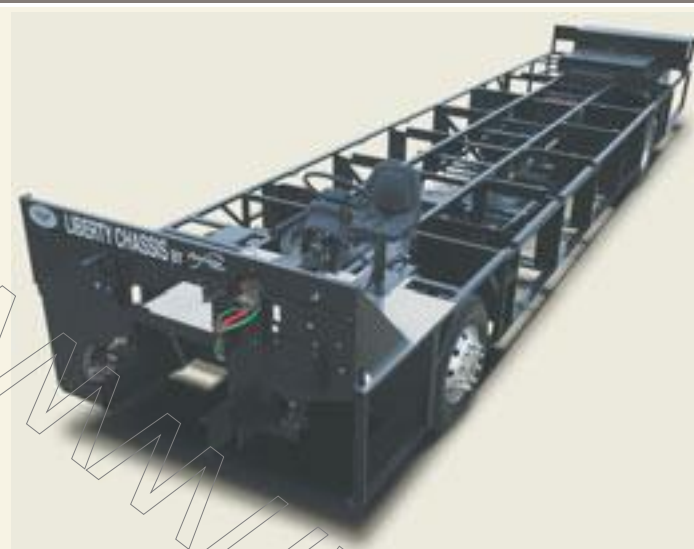
THE LIBERTY CHASSIS , available on the Revolution LE, has formerly only been offered on the American Coach Line. Fleetwood set out to design a superior, one-of-a-kind chassis that would be able to overcome the structural challenges created by designing floor plans with triple and quad slide-outs. This exclusive Fleetwood design (patent pending) strengthens the structural integrity of the driving platform by creating a strong and rigid frame that resists flexing. Enormous 15,000 lb. towing capacity to easily tow your favorite vehicle, strong steel electro-coated platform to protect against corrosion and a lightweight aluminum superstructure help to create the ideal driving experience.