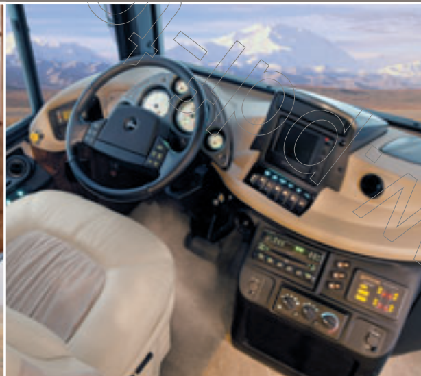
THE DRIVER'S AREA features a soft touch smart wheel with tilt and telescoping features, adjustable break and throttle pedals, flip-down drink holders and three power sun visors to provide convenient shade from the sun.