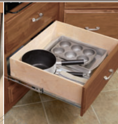
DELUXE, FULL EXTENSION, DRAWER GUIDES are standard on all the drawers throughout the coach, are very strong, and give you full access to each drawer for your storage needs.