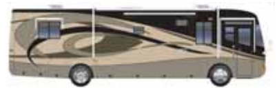
Black Opal Full-Body Paint Package

Full-Body Paint Package Color Matched Awnings (Electric Powered Main Awning) Ultra-Leather Cockpit Seats with 6-Way Power Home Theater System with Surroundsound® 10 Gallon Motor-aid® Gas/Electric Water Heater Electric Sun Visors Ceramic Tile (Kitchen and Bath) Ceramic Tile Entryway Solid Surface Counter Top Rear Air Space Saver Convection/Microwave Air Horns Day/Night Shades in Living Area 600 Watt Inverter Fantastic Power Vent Full-Width Stainless-Steel Stone Guard Awning Over Slide-Out PLUS Astoria Standard Features