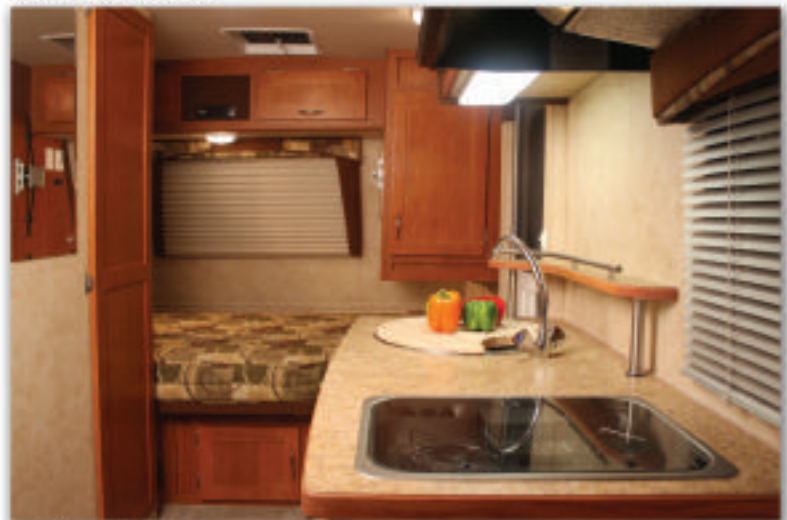
▲ Galley and Bedroom