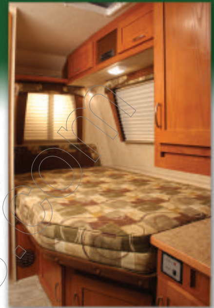
▲ Front Bed (48" x 74")