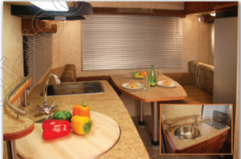
▲ Galley and Dinette

*To top of Refrigerator Vent ** Not including optional Front Cargo Box