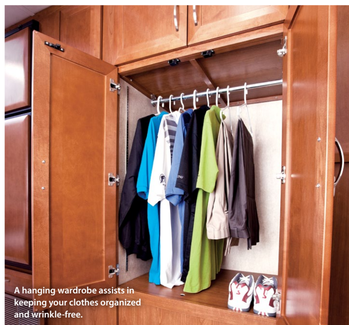
A hanging wardrobe assists in keeping your clothes organized and wrinkle-free.