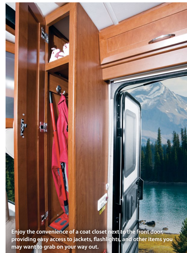
Enjoy the convenience of a coat closet next to the front door, providing easy access to jackets, flashlights, and other items you may want to grab on your way out.