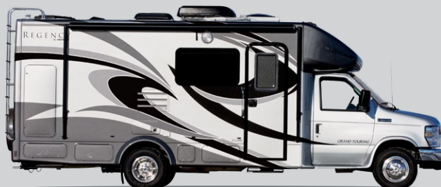
Monochrome Exterior Colour

They say that good things come in small packages, and at 24', this motorhome proves it's true! From front to back, you'll find that every available space has been carefully designed to ensure you maintain all the luxuries of a bigger RV, while offering exceptional maneuverability on the highway or in the city. Treat yourself to the gift of freedom today!