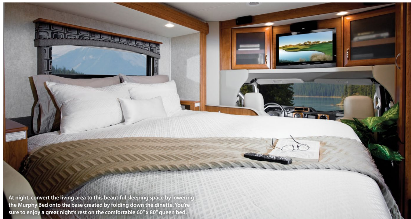
At night, convert the living area to this beautiful sleeping space by lowering the Murphy Bed onto the base created by folding down the dinette. You're sure to enjoy a great night's rest on the comfortable 60" x 80" queen bed.