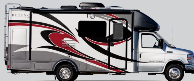
Shiraz Exterior Colour