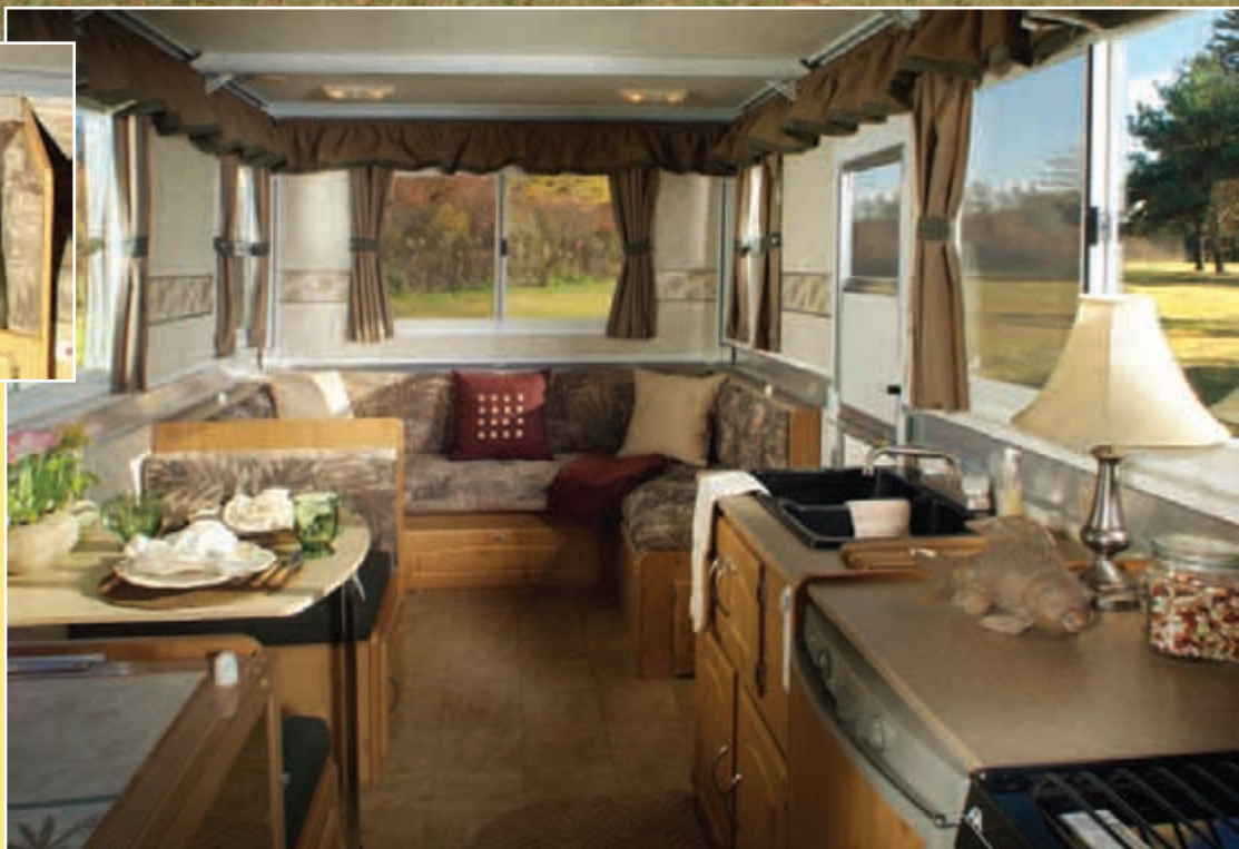
SPACIOUS INTERIOR includes a complete indoor bathroom (left) with solid wall shower and flushable ceramic commode. RESIDENTIAL STYLE GALLEY features double bowl sink, stove, oven, refrigerator and plenty of storage.