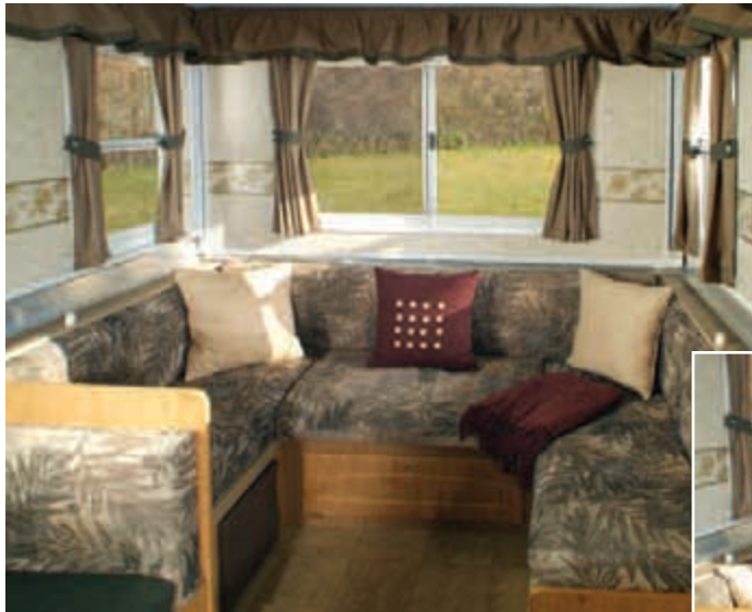
SPACIOUS AND COMFORTABLE SEATING AREA (Above and right) Converts easily for overnight accommodations.