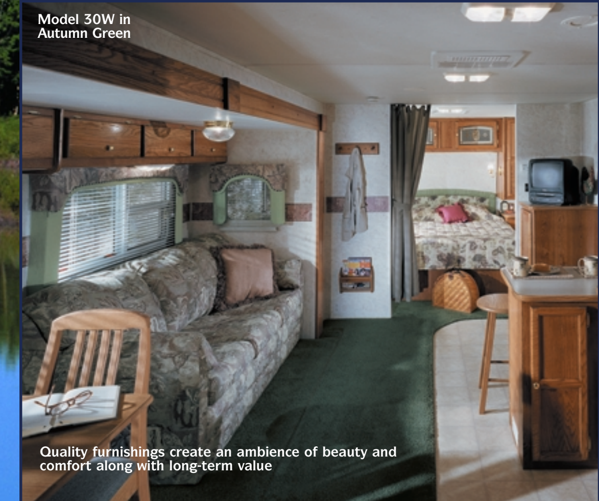
Model 30W in Autumn Green