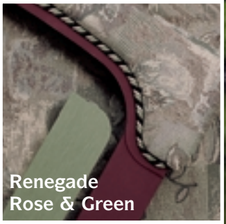
Renegade Rose & Green