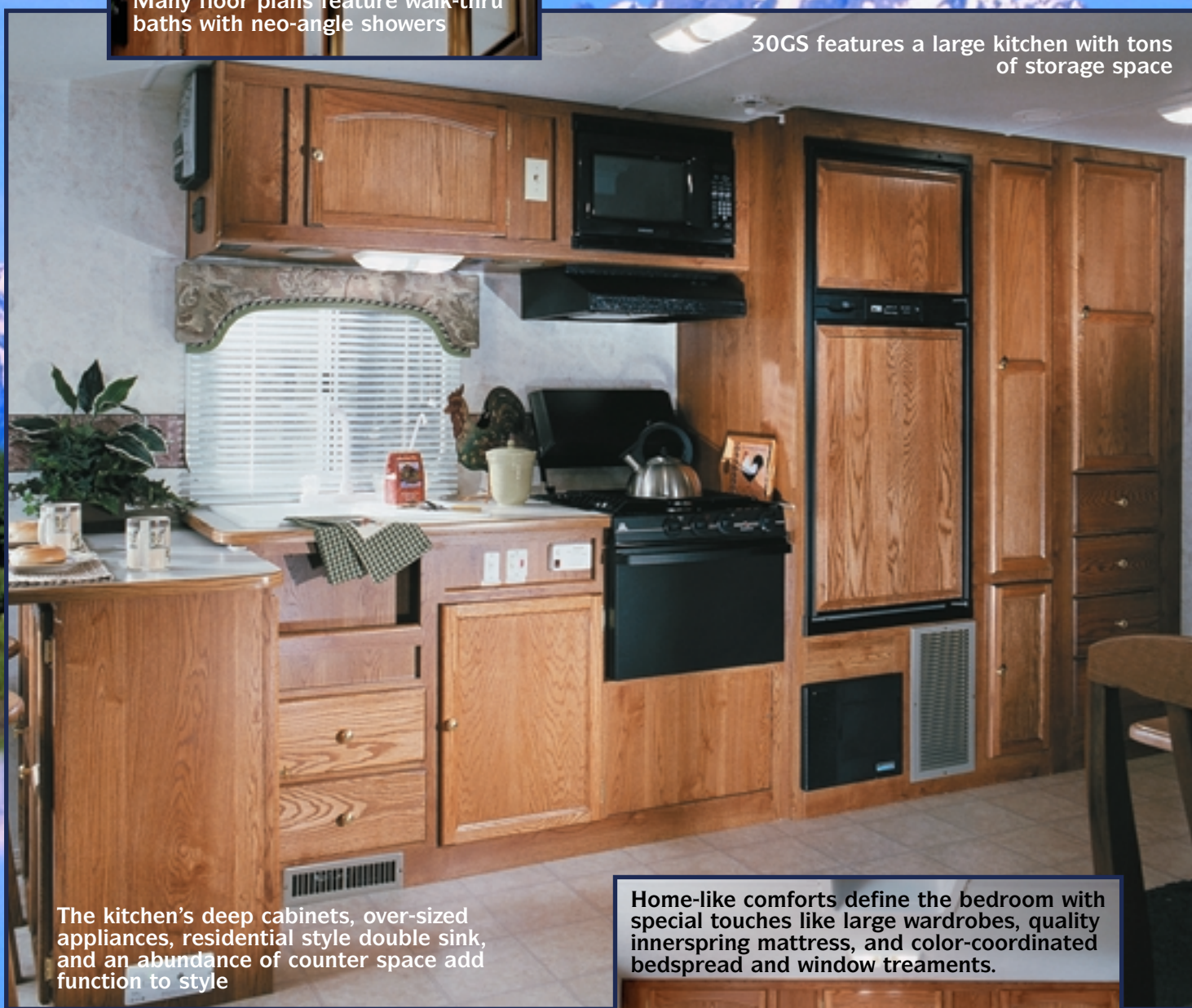
The kitchen's deep cabinets, over-sized appliances, residential style double sink, and an abundance of counter space add function to style