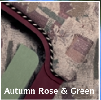
Autumn Rose & Green