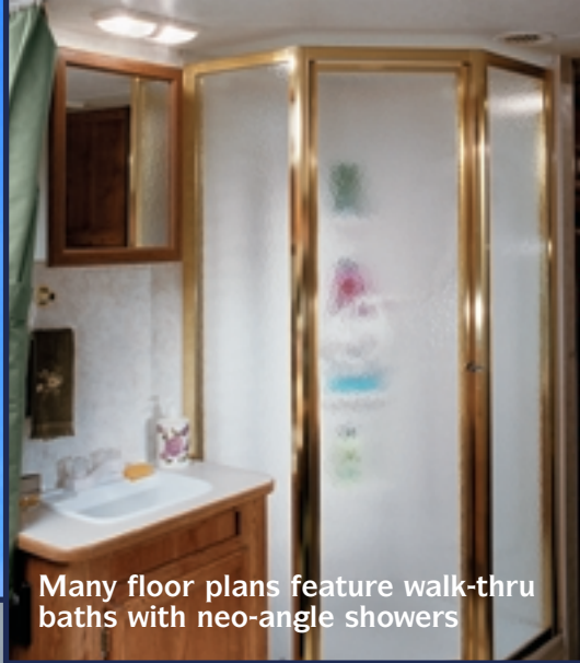
Many floor plans feature walk-thru baths with neo-angle showers