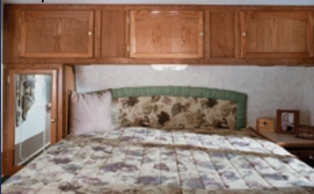
Home-like comforts define the bedroom with special touches like large wardrobes, quality innerspring mattress, and color-coordinated bedspread and window treatments.