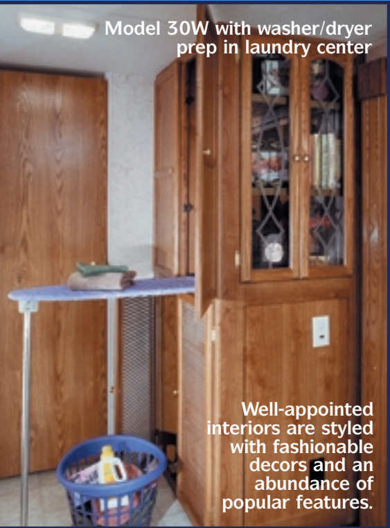
Model 30W with washer/dryer prep in laundry center

SKAMPER ULTRA shows you that high-end quality can be achieved in a lightweight design. The Skamper Ultra gives you both luxury and towability, plus an affordable price for astounding value. Fine fabrics and imposing cabinetry, along with quality furnishings, subtly blend together to fashion interiors with refined elegance. On the outside, the fiberglass laminated exterior on an all-aluminum super-structure frame exhibits the same level of refinement. The Skamper Ultra brings a higher degree of comfort and pleasure within the reach of today's families.