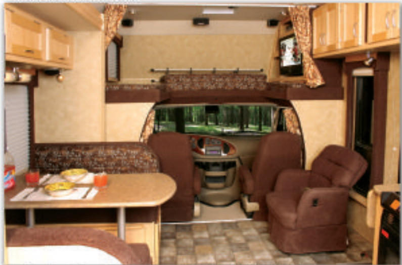
▲ Dinette and Front Bunk shown with optional 26" LCD HDTV

This brochure may not be used for contractual purposes. Bigfoot Industries reserves the right to improve or modify its products without prior written notice.