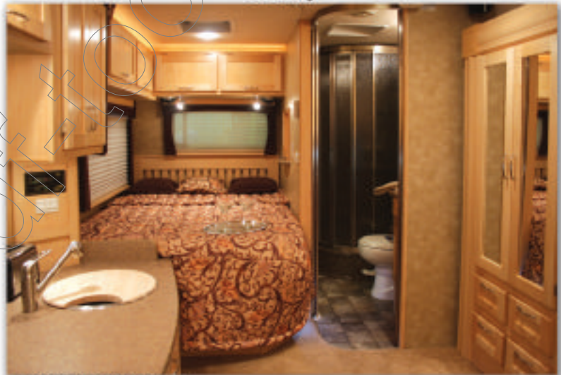
▲ Bedroom and Bathroom