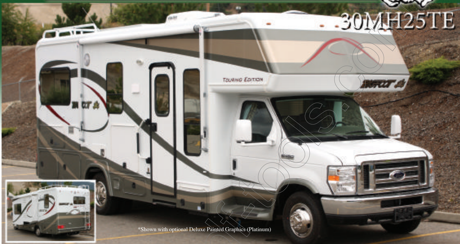
*Shown with optional Deluxe Painted Graphics (Platinum)